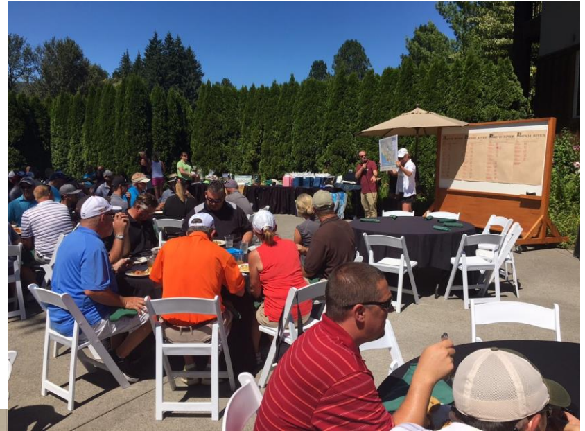
Left: Chamber biz awards dinner