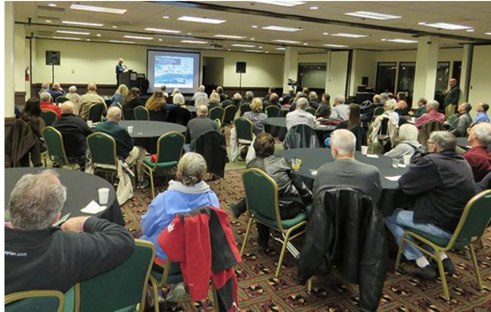
Attendees at the Railroading 101 lecture

- Meet ILWU Local 4 featuring Longshore men and women