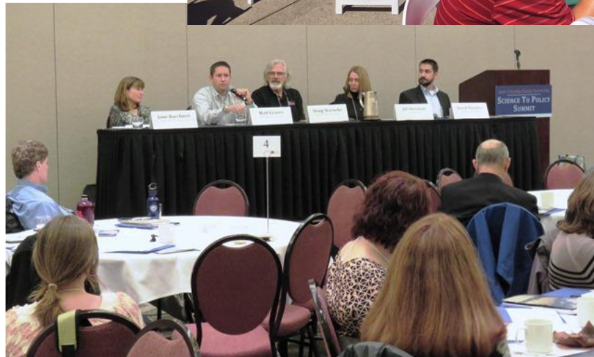
Left: LCEP Science to Policy summit