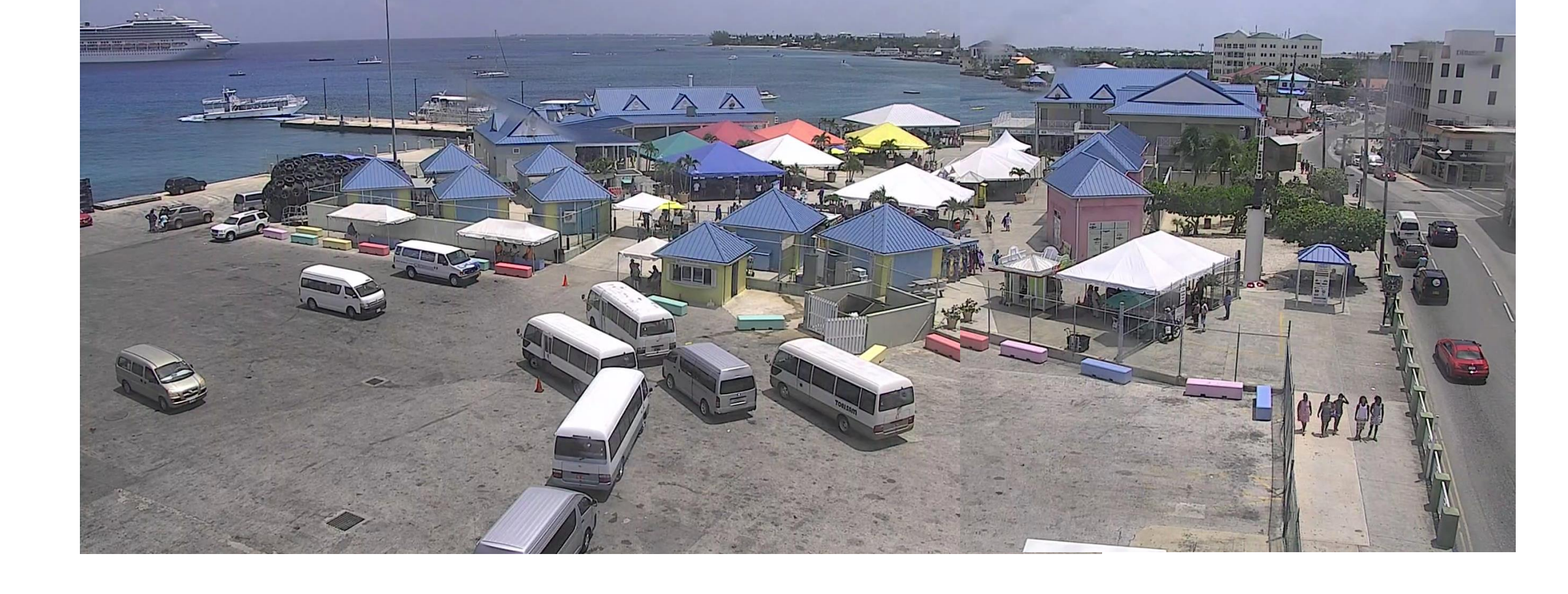
Royal Watler Cruise Terminal