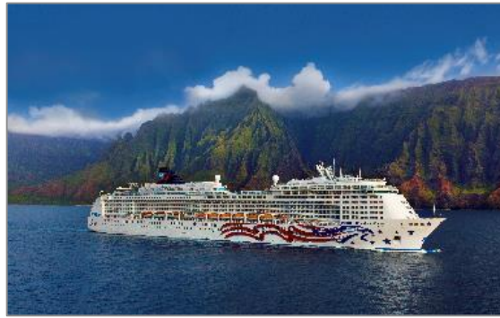
Exclusive Hawaii Offering (Pride of America)