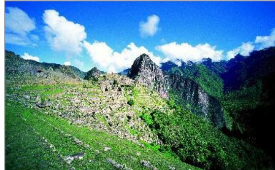
Immersive Itineraries (Three-day excursion to Machu Picchu)