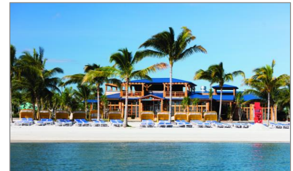
Private Resort Destination (Harvest Caye, Belize)