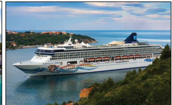
Norwegian Spirit Rounds Out Norwegian Edge® Investment January 2020