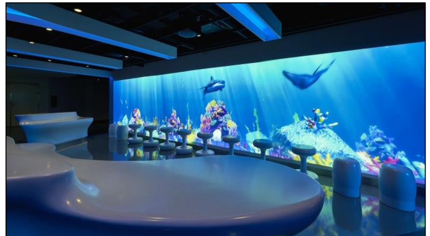
Galaxy Pavilion: 10,000 sq. ft. of Interactive Gaming