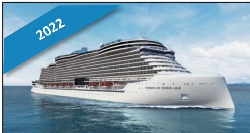
LEONARDO I 3,300 berths