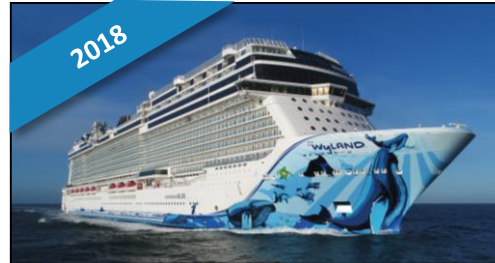
NORWEGIAN BLISS 4,000 berths