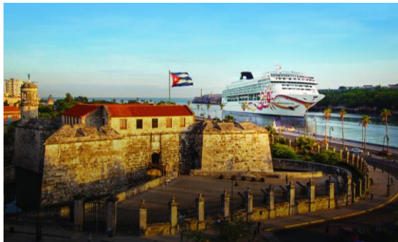
Overnights in Havana, Cuba (Norwegian Sun & Sky)