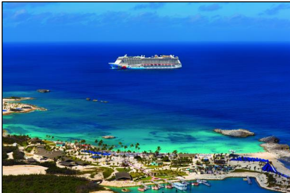
Youngest Fleet with a Global Presence