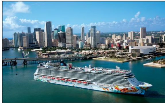
Norwegian Getaway undergoes Norwegian Edge® May 2019