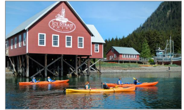
Authentic Alaska Experience (Icy Strait Point)