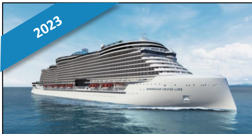
LEONARDO IV 3,300 berths