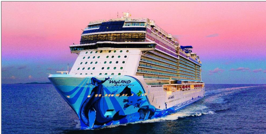
Norwegian Bliss sailing the Caribbean