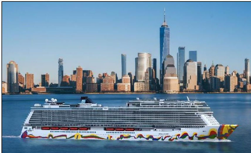
Norwegian Encore sailing from NYC in 2020