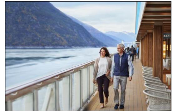
Bringing guests closer to the majesty of the ocean ( The Waterfront Promenade )