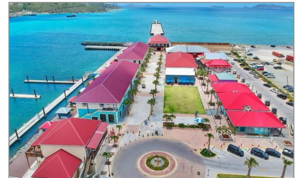
Tortola, British Virgin Islands (2015)