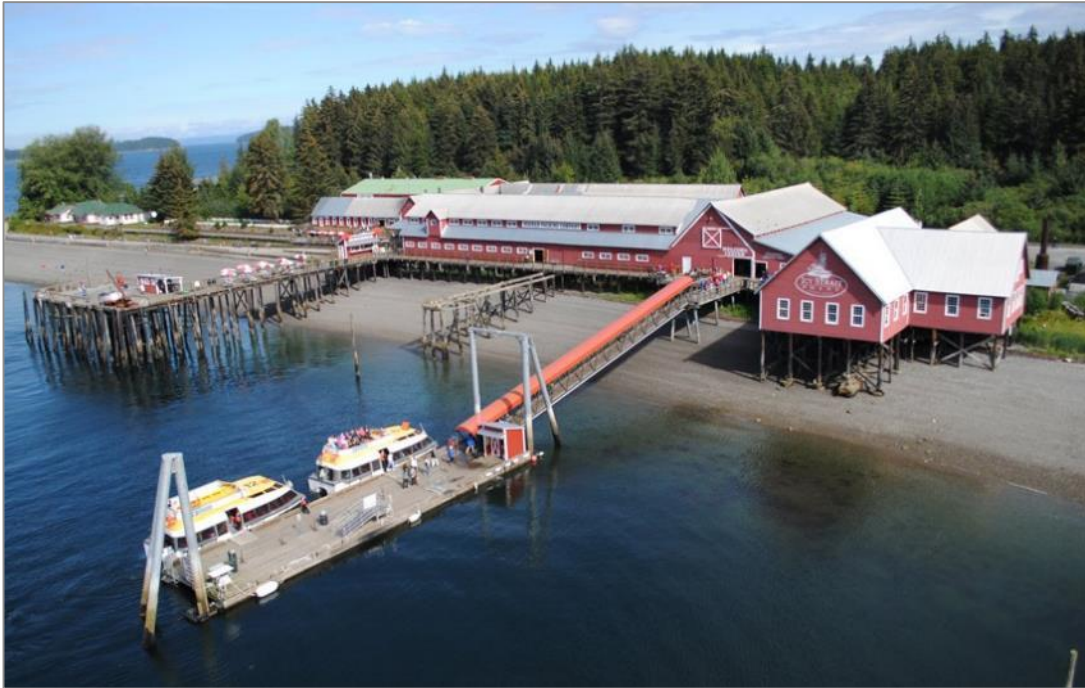
Icy Strait Point, Alaska (2020)