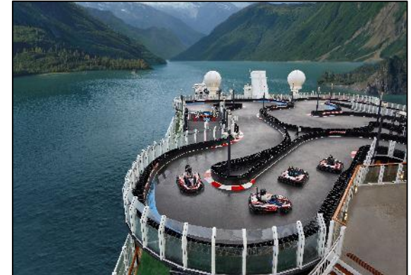
Exclusive Experiences ( Race track on Norwegian Joy and Bliss )