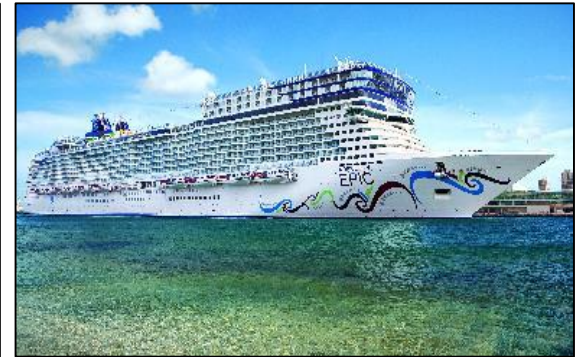
Norwegian Epic Homeports in San Juan, Puerto Rico December 2019