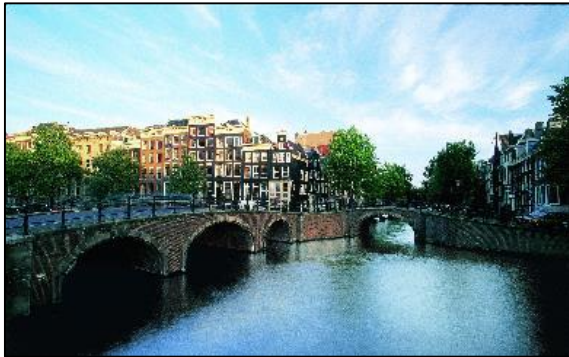
Norwegian Pearl Homeports in Amsterdam May 2019