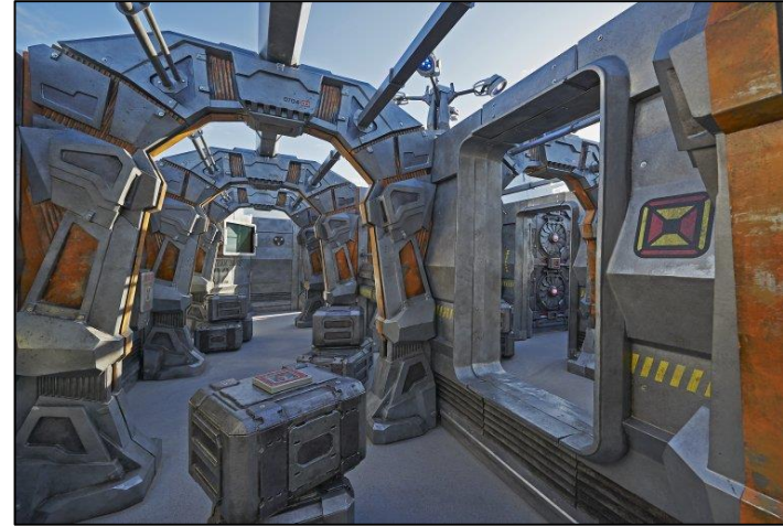
Leader in innovative activities (Open-air laser tag arena on Norwegian Bliss )