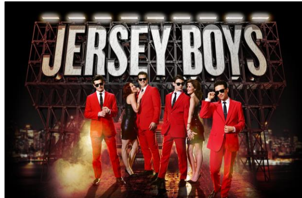
Award-Winning Entertainment ( Jersey Boys on Norwegian Bliss )