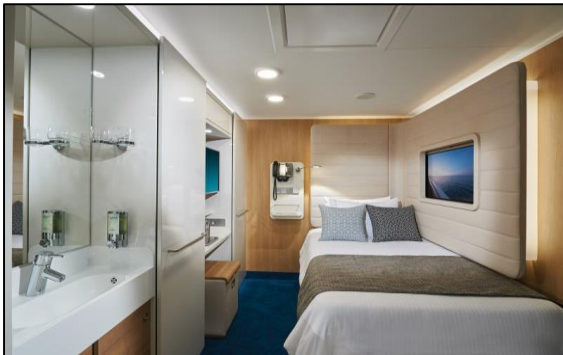
First to offer Studios -Designed/priced for single traveler- ( Studio on Norwegian Bliss )