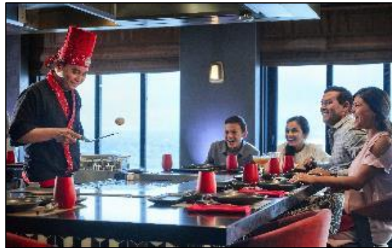
Innovator offering Freestyle Dining & Entertainment (27 Restaurant and Bar Options)