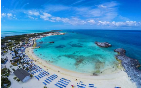
First Private Island Experience (Great Stirrup Cay, Bahamas)