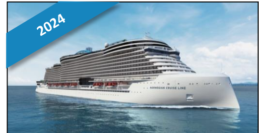
LEONARDO III 3,300 berths