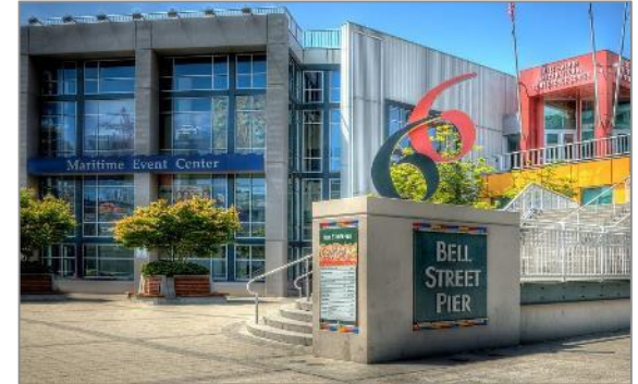
Bell Street Pier, Seattle (2017)