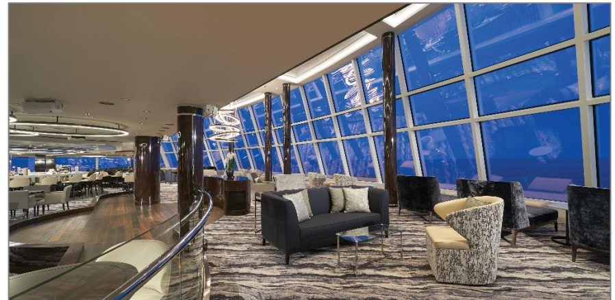
Norwegian Bliss Observation Lounge