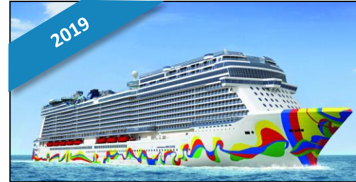
NORWEGIAN ENCORE 3,900 berths