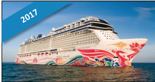
NORWEGIAN JOY 3,900 berths