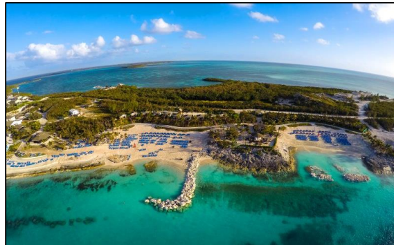
Great Stirrup Cay Ongoing Enhancements