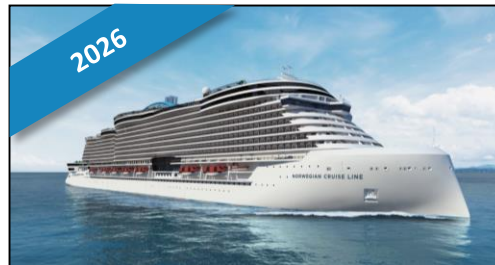
LEONARDO V 3,300 berths