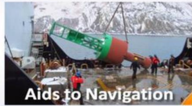
Aids to Navigation