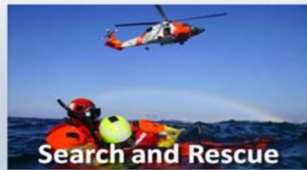
Search and Rescue