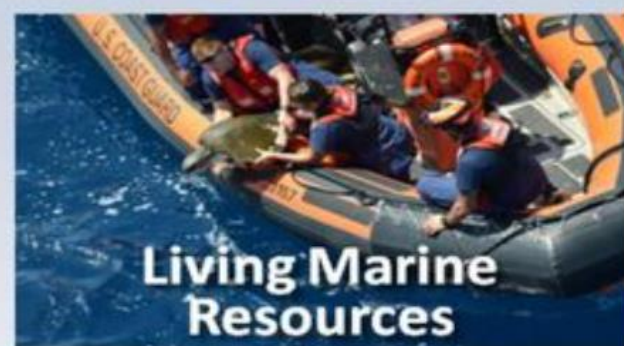
Living Marine Resources