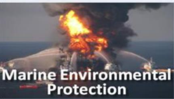
Marine Environmental Protection