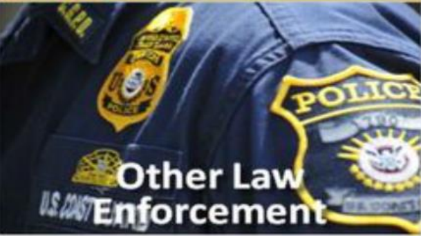
Other Law Enforcement