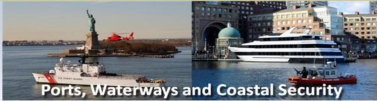
Ports, Waterways and Coastal Security