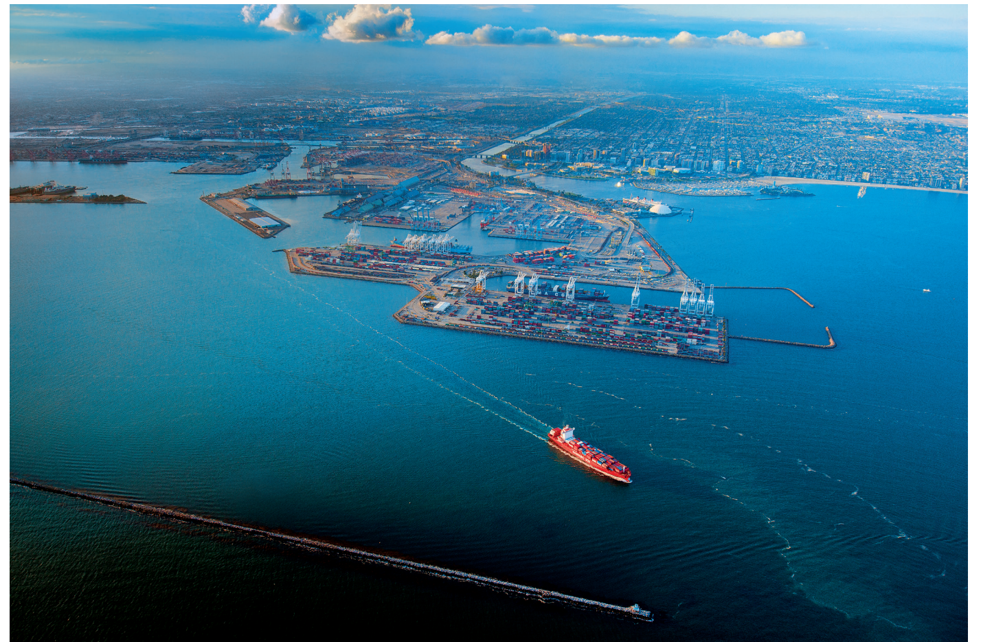
The Port of Long Beach

The Port of Long Beach has a strong social media following and the harbor tours are immensely popular, so the Communications team found a way to combine the two.