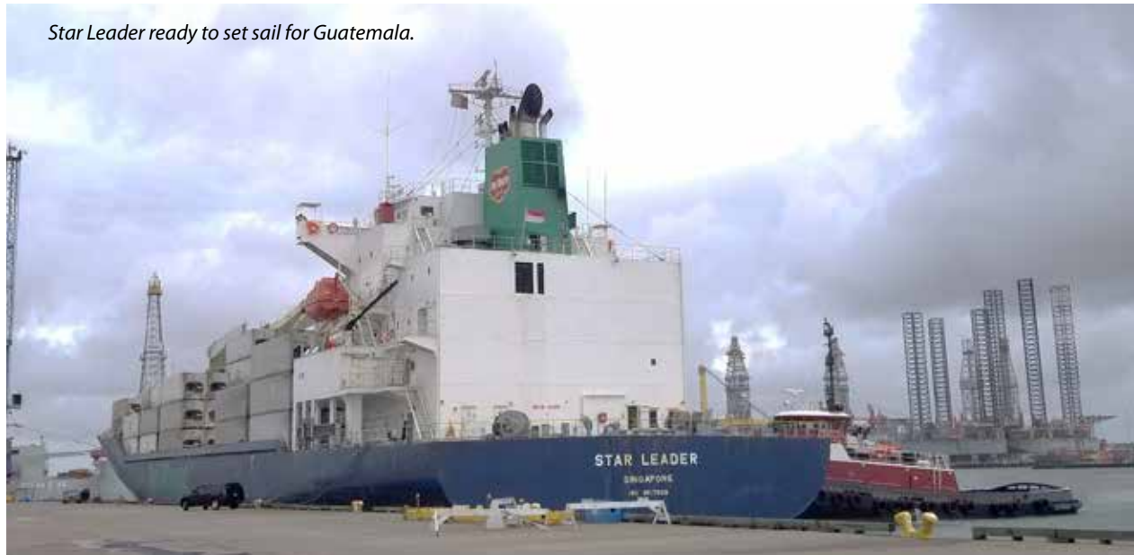
Star Leader ready to set sail for Guatemala.