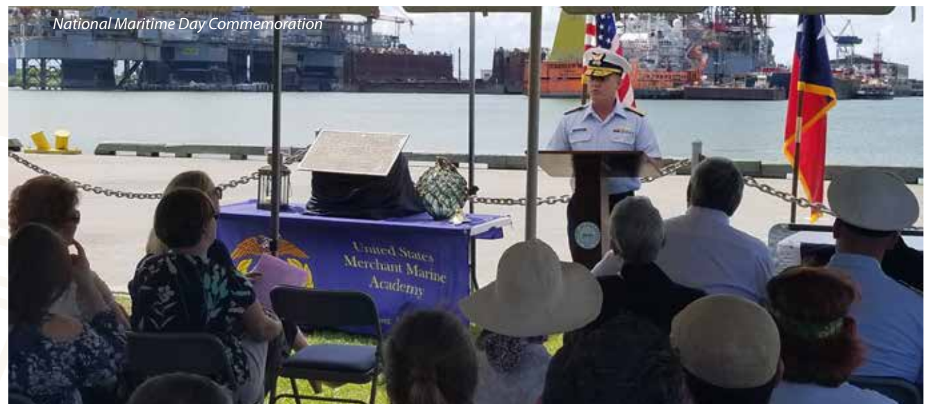
National Maritime Day Commemoration

The ceremony also included the reading of the Presidential Proclamation of National Maritime Day. The heart of the formal military ceremony was a commemorative wreath presentation in solemn remembrance of mariners who died in service to the nation. During the recognition, guests stood and service members saluted. The wreaths are eventually placed on the Merchant