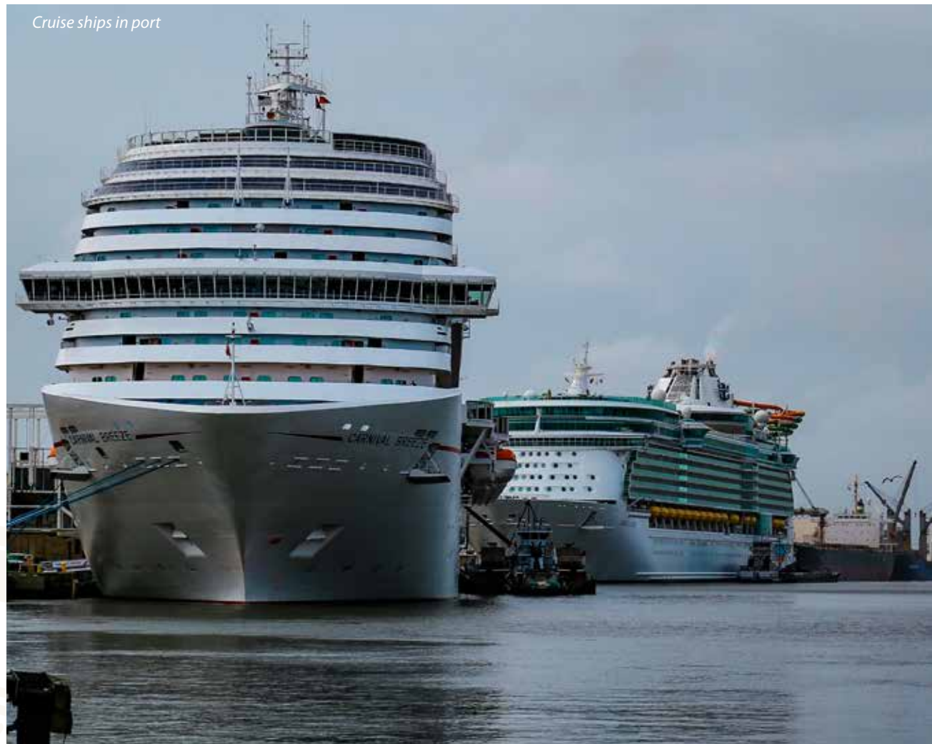
Cruise ships in port

The Port of Galveston announced that it achieved a new milestone in 2018, with 1,966,176 passenger movements, surpassing previous passenger volumes and setting a record as the busiest year since the port began its cruise business on September 30, 2000. In addition, the Port achieved another significant milestone in December; it welcomed its 10 millionth cruise passenger since beginning cruise operations.