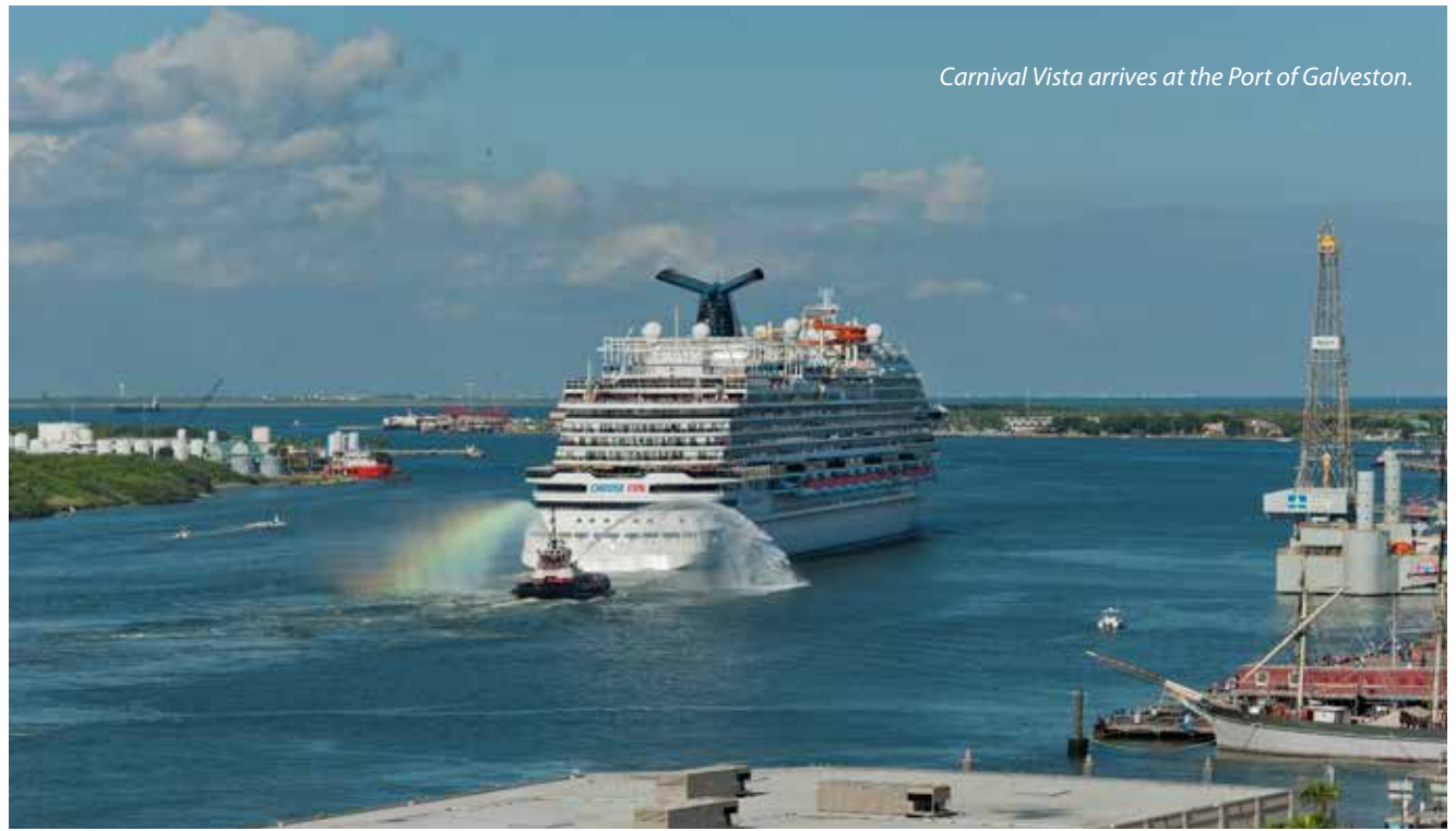
Carnival Vista arrives at the Port of Galveston.

While specific designs and costs have not yet been announced, some details have been revealed. The new terminal will cover approximately 200,000 square feet on ten acres of land in the