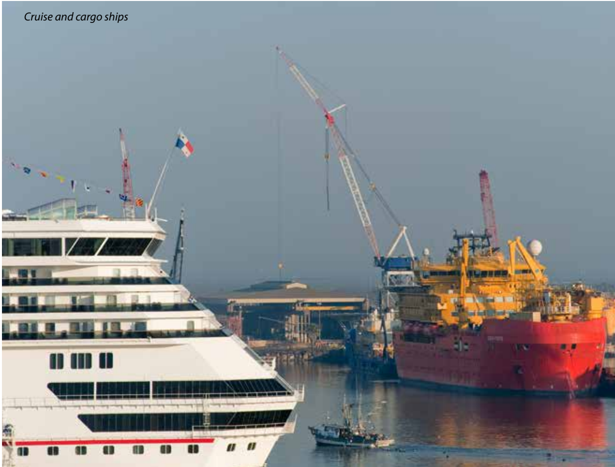
Cruise and cargo ships

The Board of Trustees hired a consulting firm to assist Port staff in facilitating the development of a strategic plan. Over the course of the next year, the Port of Galveston will be creating a Strategic Master Plan that will assist in guiding the Port over the next 40-years.