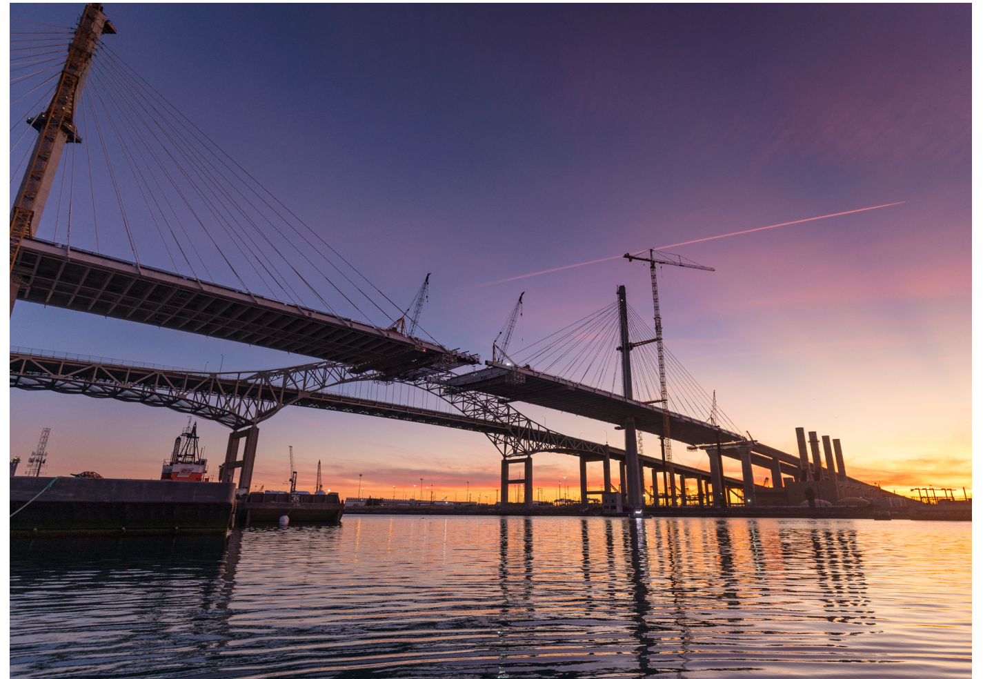
New Gerald Desmond Bridge under construction