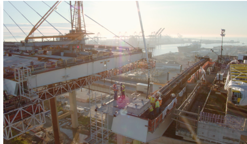
State of the Port - Bridge Video clips