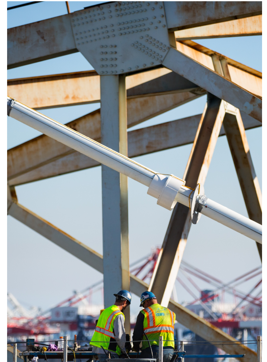
Workers on the new Gerald Desmond Bridge

Budget – Total out-of-pocket cost for the Bridge Video was $ _____, including video and production charges. Port Communications staff time for coordinating with the contractor is not included.