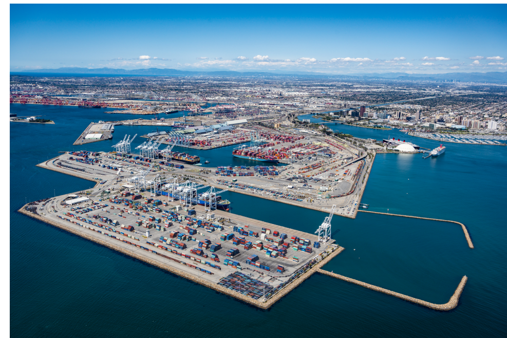
The Port of Long Beach

latter stages of construction. This video would also serve to salute the bridge team and construction workers, exemplifying the theme of a “Year of Collaboration” making the Port’s success possible. The bridge video would serve as a companion piece to a second video included at the beginning of the address saluting all port workers. The two would be linked by sound tracks featuring the music of the great American composer Aaron Copland, continuing an inspirational thread throughout the address.