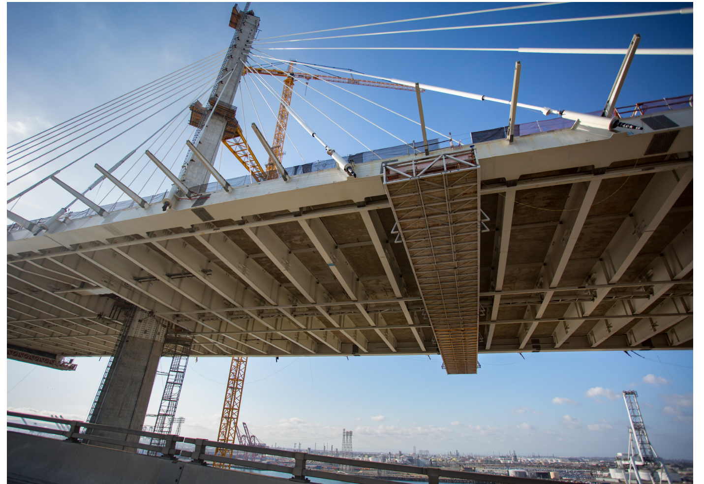
New Gerald Desmond Bridge under construction