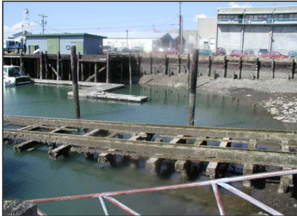
Weldcraft Site Before