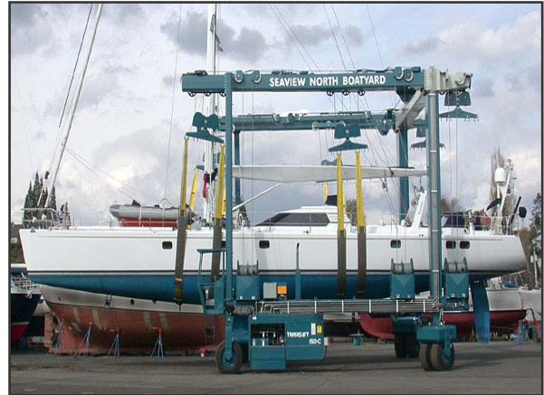
Weldcraft Site After

The Port used creative partnerships and grant funding to substantially reduce the total project costs and, in particular, mitigation costs. ACOE constructed the habitat bench without charge, beneficially re-using sediment from regularly scheduled maintenance dredging of a nearby federal channel. DNR waived the normal fee for dredging state-owned material from the federal channel, and also allowed construction of the habitat bench without financial compensation to DNR. The Port obtained a grant from Ecology for $900,000 to clean-up contaminated sediments reducing the total cleanup and redevelopment costs to $3.3 million dollars. Without cost-effective partnerships and grant funding, the site would still be vacant and contaminated.