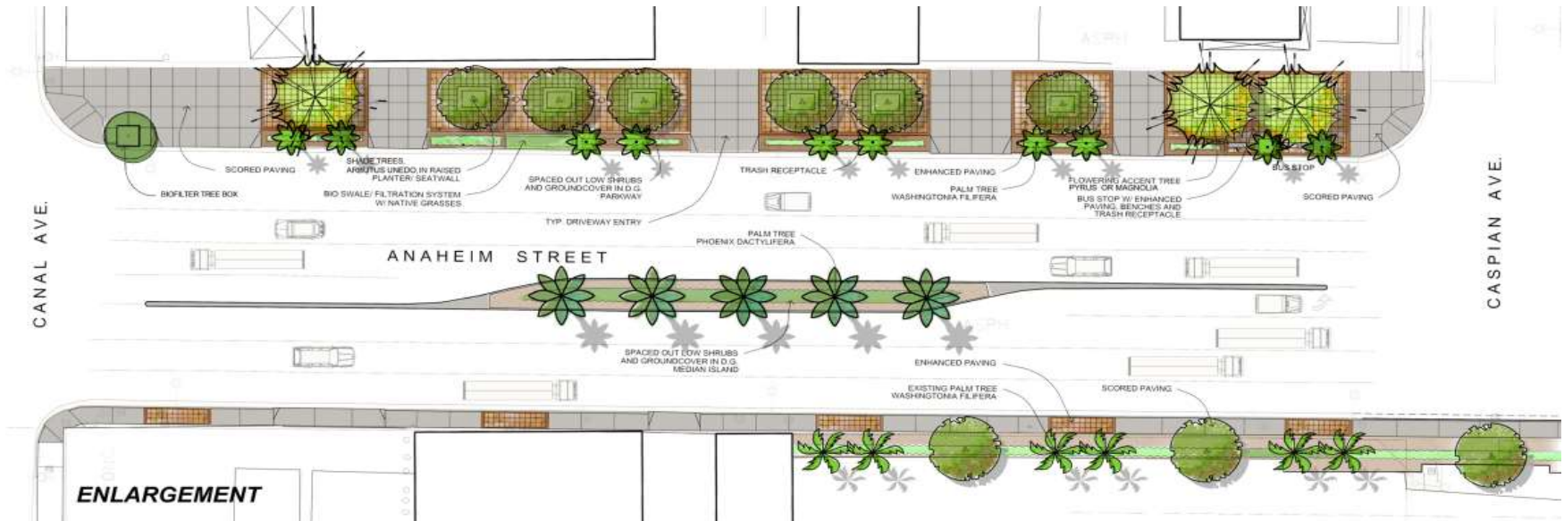
Diagram displaying an enlargement of the Anaheim street improvements, including the placement of biofilter tree boxes, bioswales, and native plants.