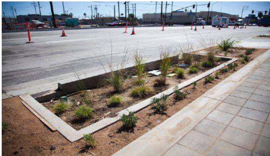
Bioswales set to capture stormwater runoff