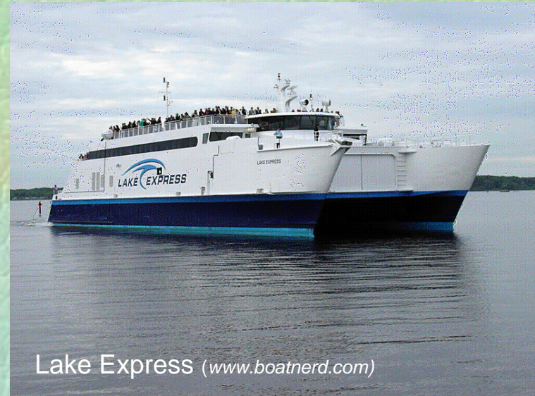
Lake Express ( www.boatnerd.com )