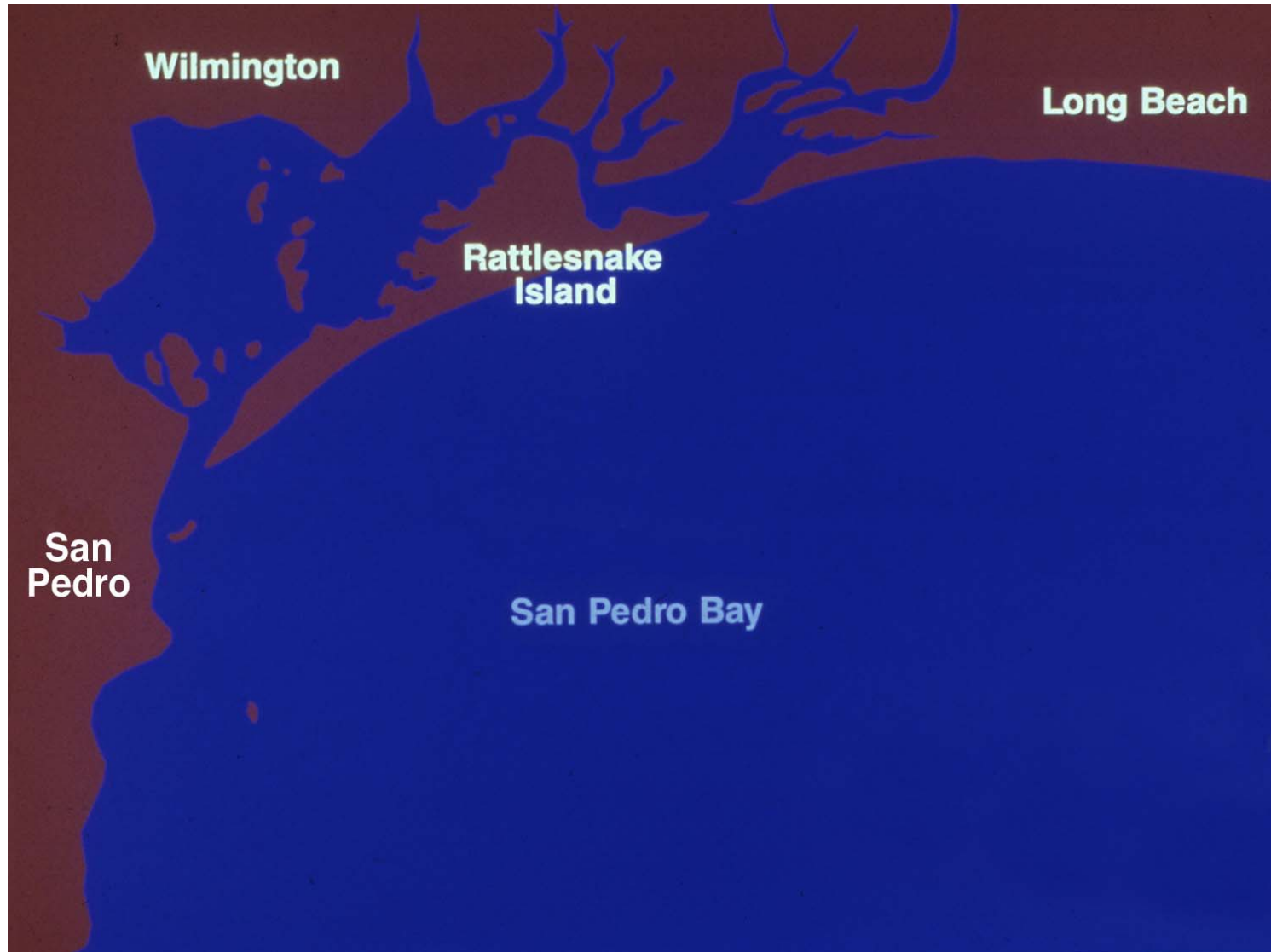
San Pedro Bay 1872