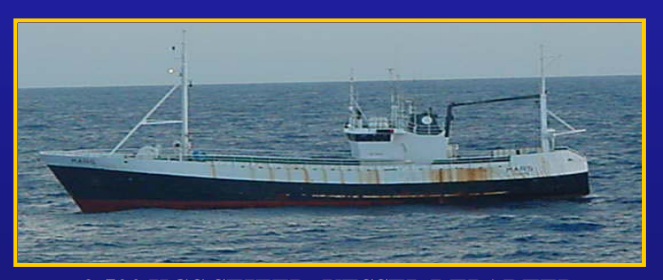
2,500 KGS SEIZED. VESSEL DEPARTED EUROPE, OLOADED IN WESTERN ATLANTIC EN ROUTE WEST AFRICA - F/V MARS