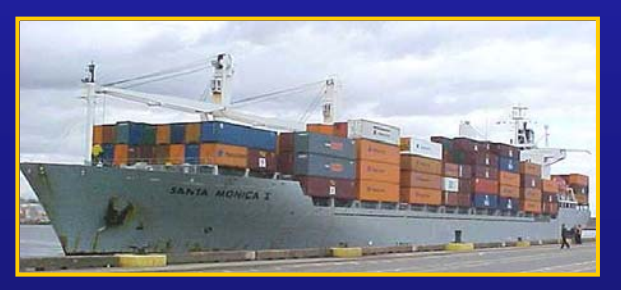
1,410 KGS DISCOVERED IN CONTAINER OF WHEAT, LIQUID SOAP, AND FLOUR EN ROUTE MEXICO - M/V SANTA MONICA