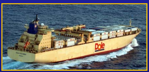
33 KGS DISCOVERED IN CONTAINER OF BANANAS EN ROUTE WILMINGTON, DELAWARE – M/V DOLE COLOMBIA