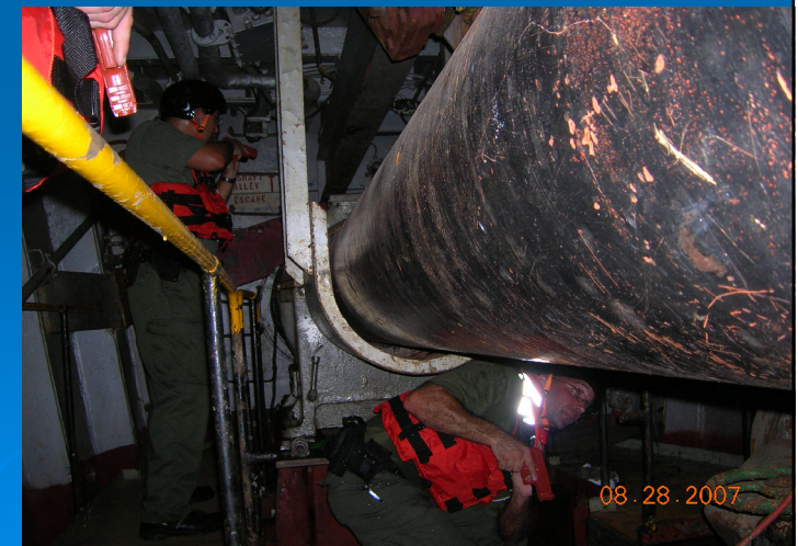
Clear Shaft Alley