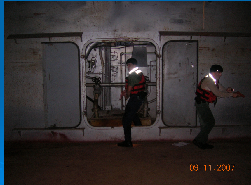
MAKING ENTRY TO CARGO HOLD #3