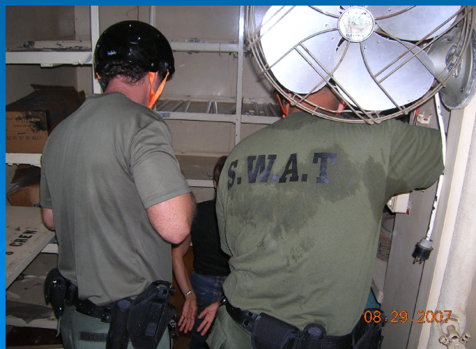
Students Arrest a Stow Away in a Confined Space