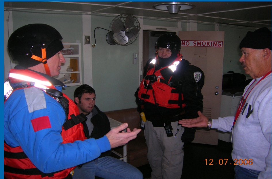
Muster the Crew