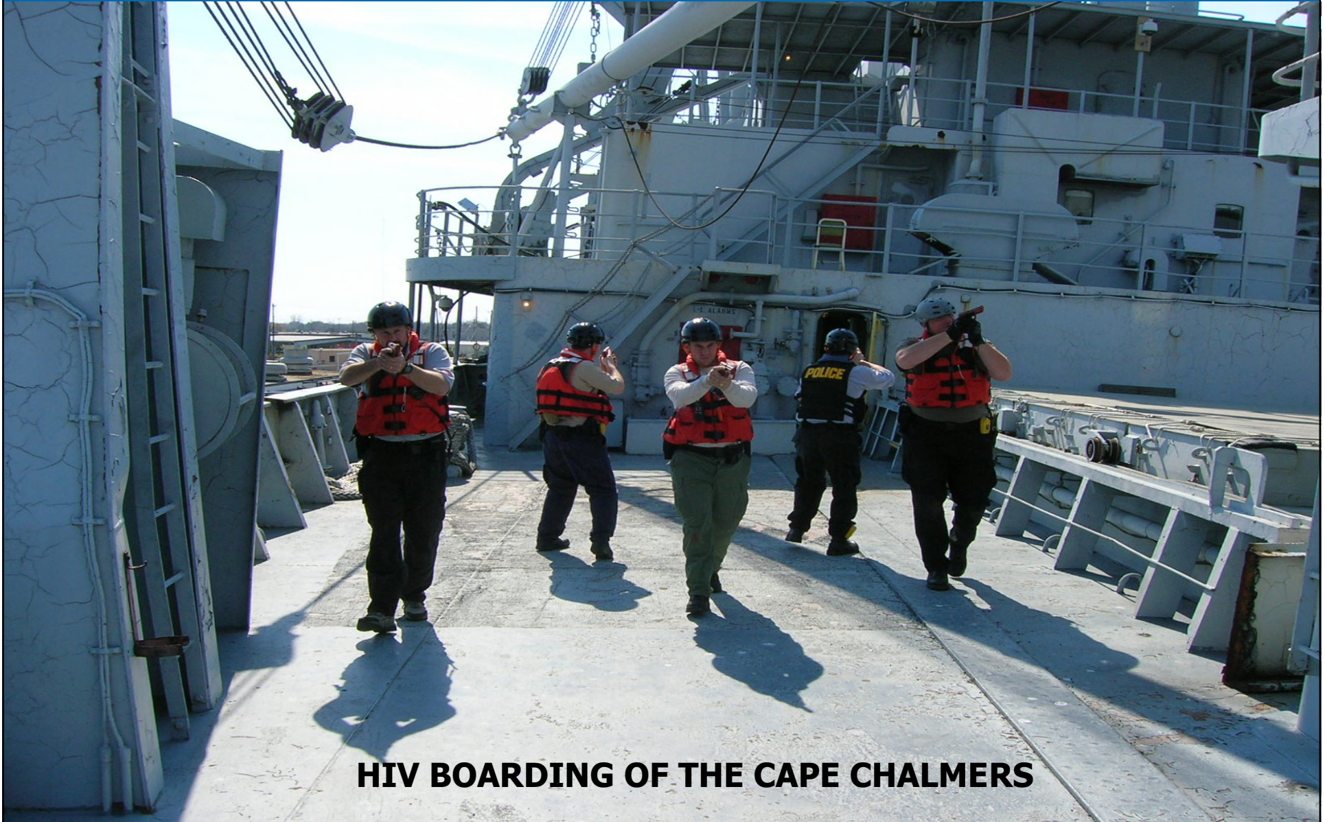
HIV BOARDING OF THE CAPE CHALMERS