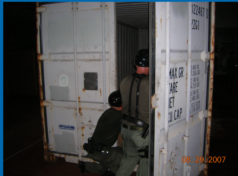
Students Clear a Container in a Low Light Confined Environment