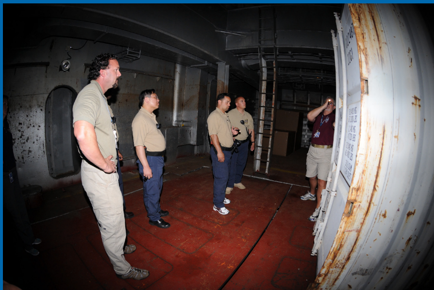
FLETC Instructors Demonstrate the Clearing of a Container Door for Hazards, Suspects, Contraband and Shifting Merchandise