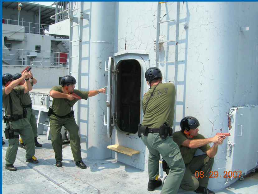
Clearing the Ship