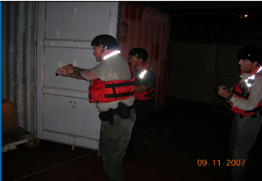
CLEARING/SEARCHING A CONTAINER