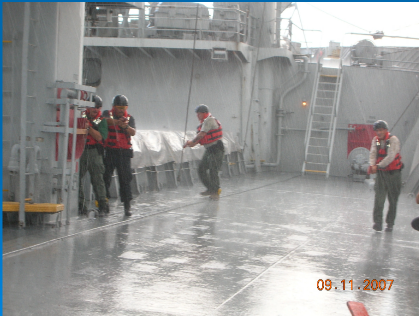
8/1/2008 ADVERSE CONDITIONS