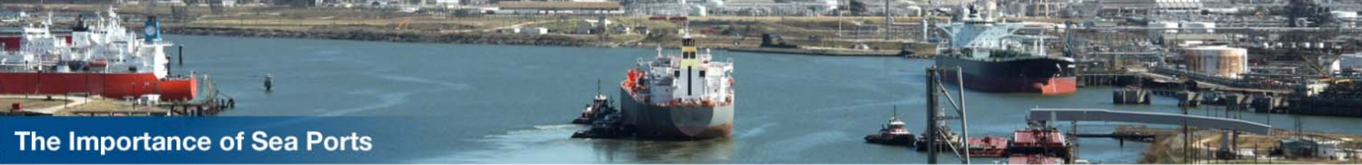
The Importance of Sea Ports