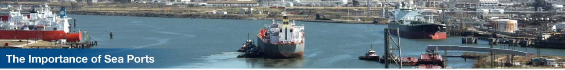
The Importance of Sea Ports