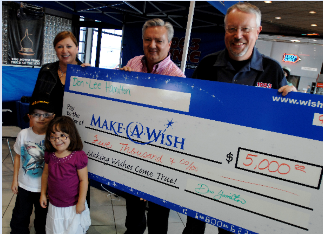
Building Corporate Assistance