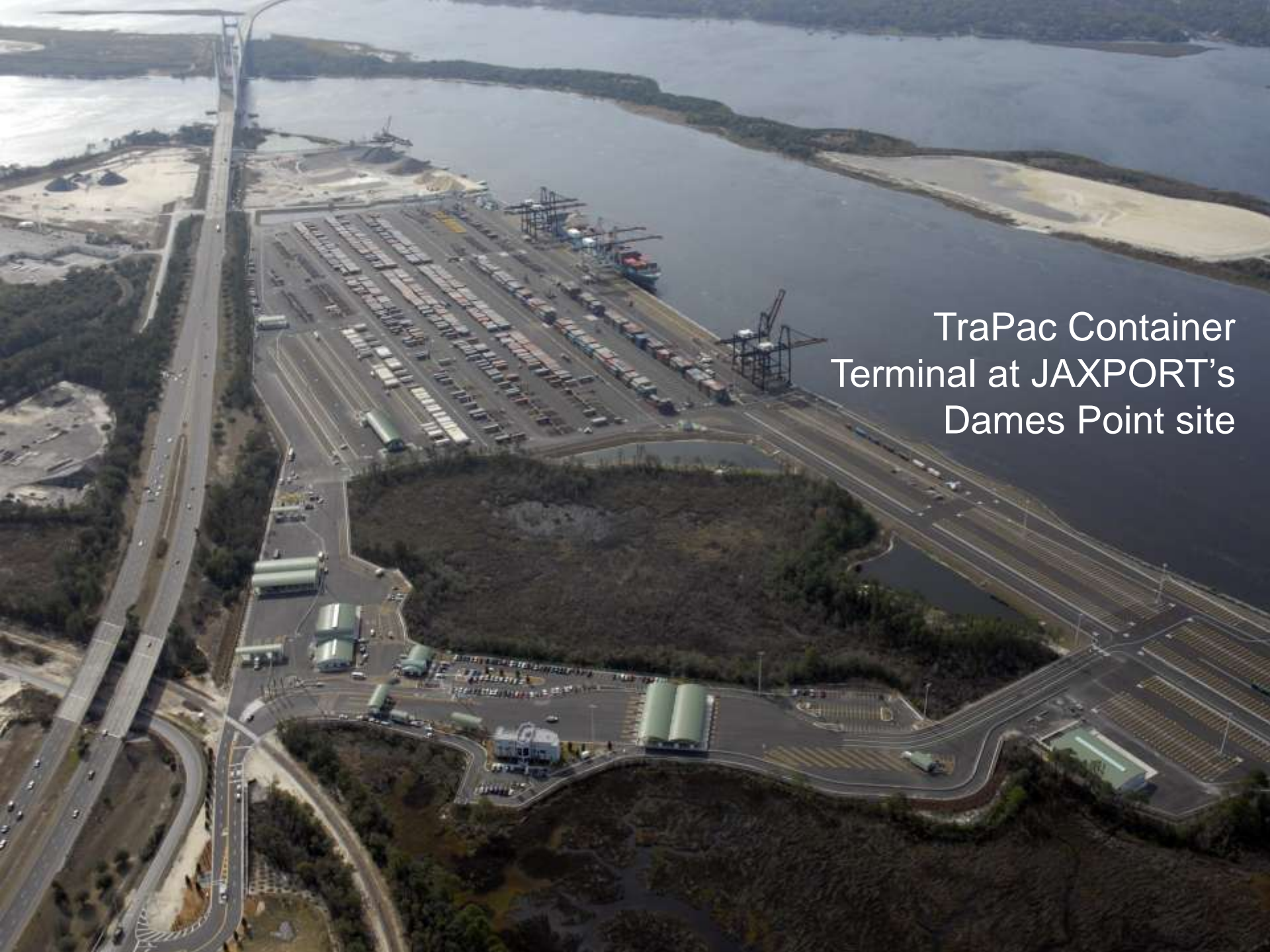
TraPac Container Terminal at JAXPORT's Dames Point site