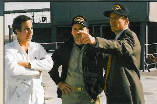
Congressman Jack Kingston (1 st District Ga.) visiting with crewmembers aboard the USNS Mendocino docked at the Port of Savannah's Ocean Terminal.