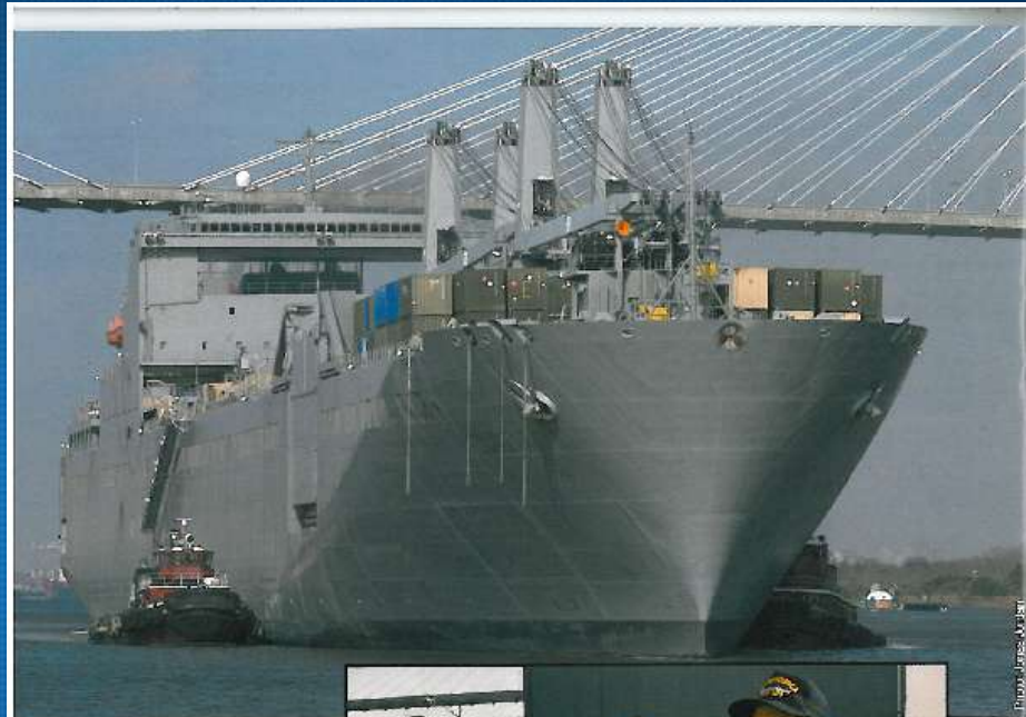
The USNS Mendocino sails from the Port of Savannah's Ocean Terminal.