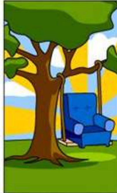
How the Business Consultant described it