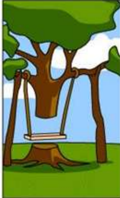
How the Analyst designed it