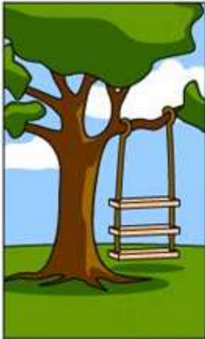
How the customer explained it