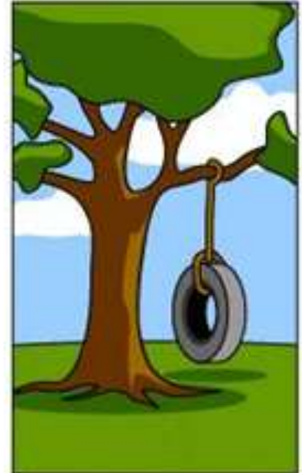
What the customer really needed