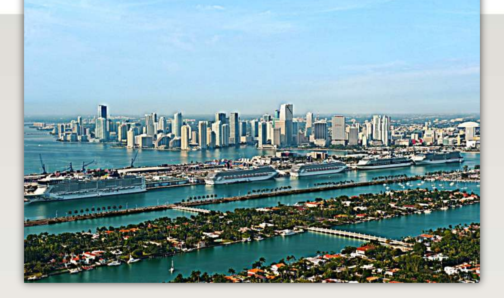
Cruise Capital of the World