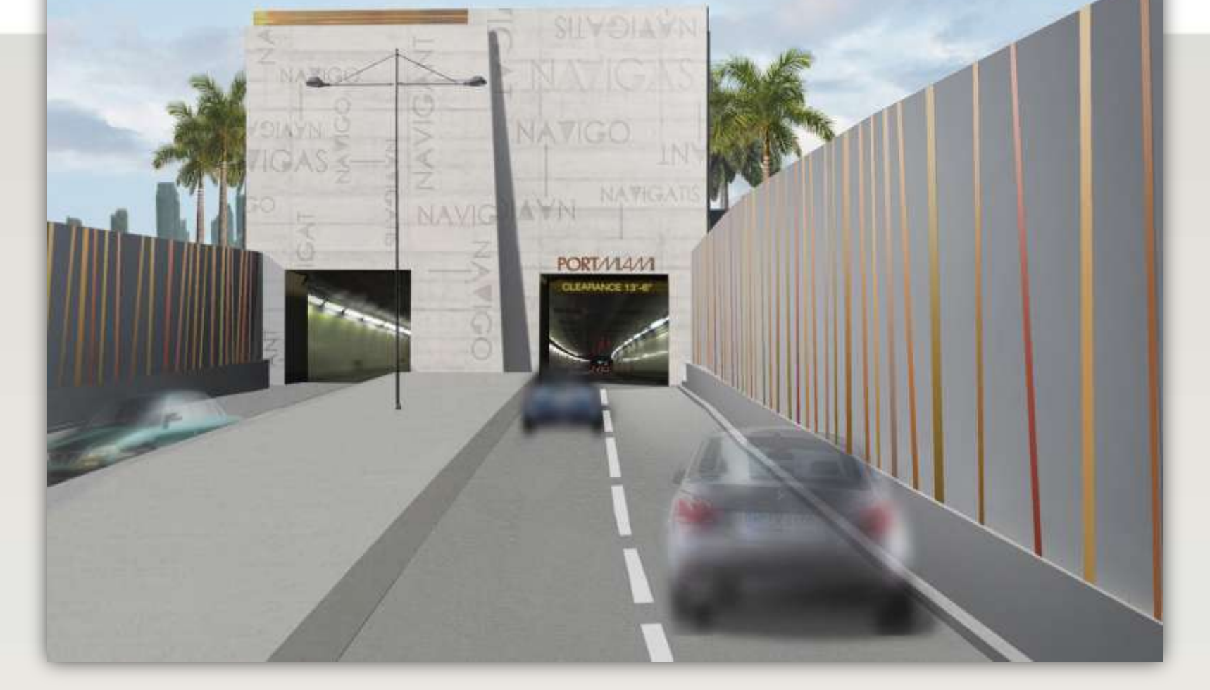
Welcome to the New PortMiami