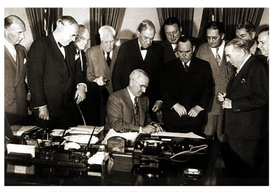
President Truman signs the European Recovery Act