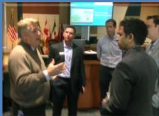
Leadership Tampa Bay