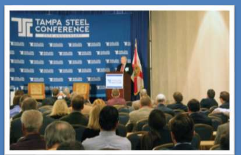
25<sup>th</sup> Annual Tampa Steel Conference