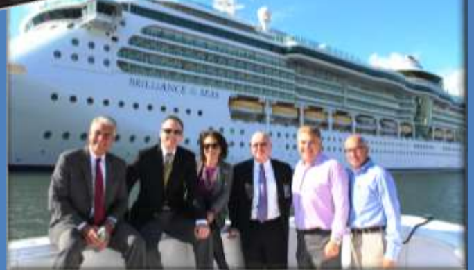
Tampa International Airport Executives