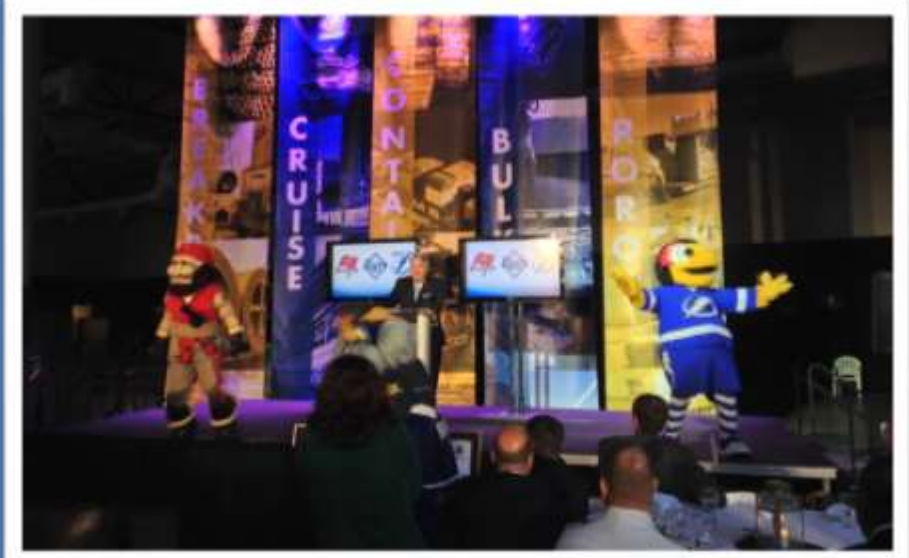
State of the Port