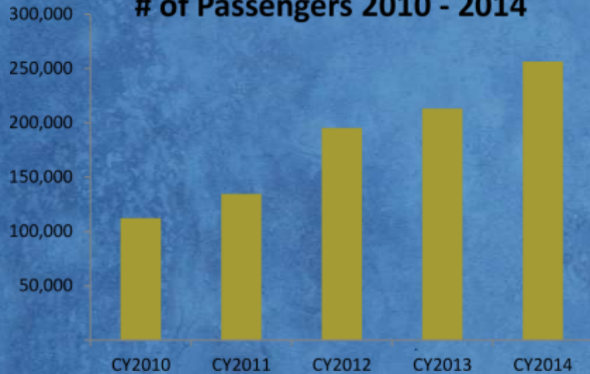
# of Passengers 2010 - 2014

Five straight years of increasing passengers and revenue