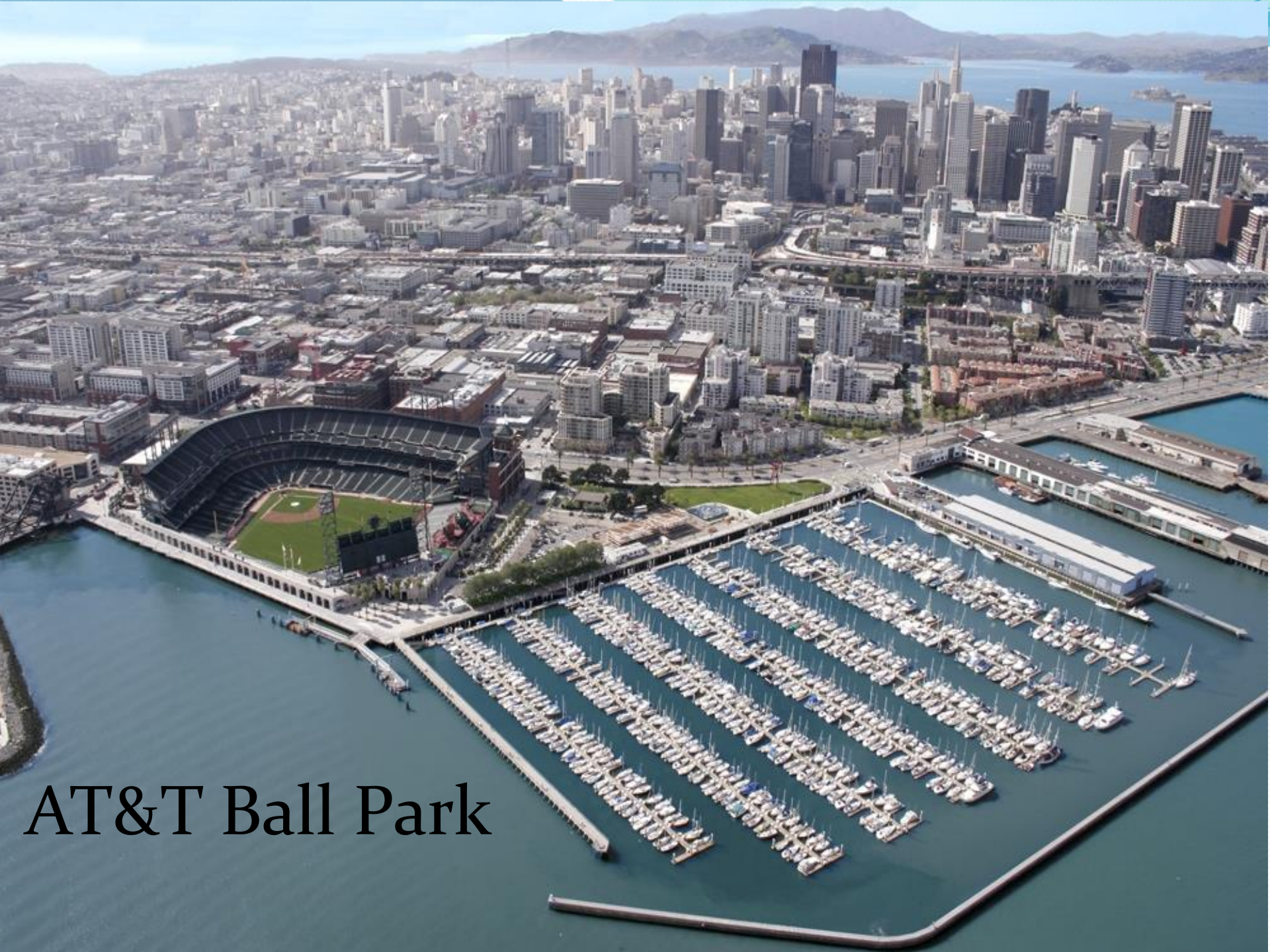
AT&T Ball Park