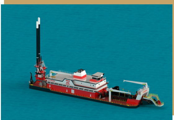
Weeks Marine – JS Chatry Cuttersuction Dredge (30-Inch) C&C Shipyard, LA - $60 M. (Under Construction)