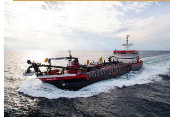
Weeks Marine – Magdalen Hopper Dredge – 8,550 cy Eastern Shipyard, FL - $110 M. ( Delivered )