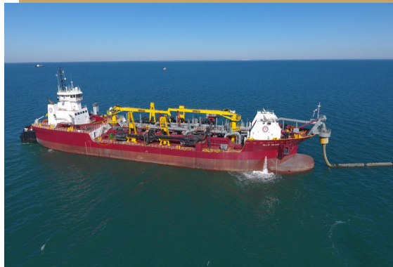
Great Lakes Dredge & Dock – Ellis Island Hopper Dredge – 14,800 cy Eastern Shipyard, FL - $160 M. ( Delivered )