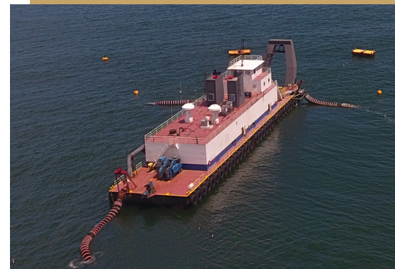
Marinex Construction – Wadmalaw Cuttersuction Dredge (30-Inch) Corn Island Shipyard, IN - $21 M. ( Delivered )