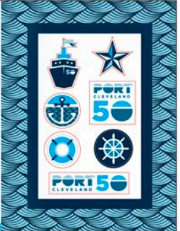
COLORING KIT, STICKERS & TEMPORARY TATTOOS