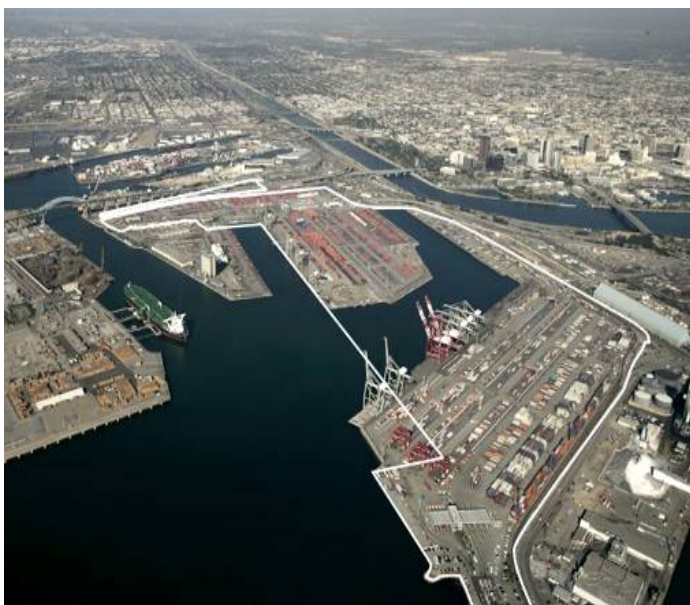
Middle Harbor Terminal Before Construction