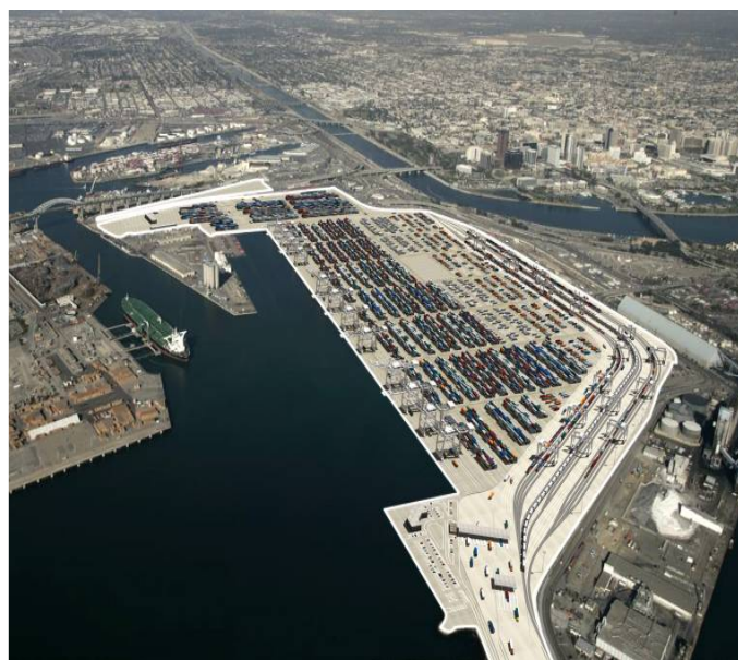
Artist's Rendition of Completed Middle Harbor Terminal Redevelopment