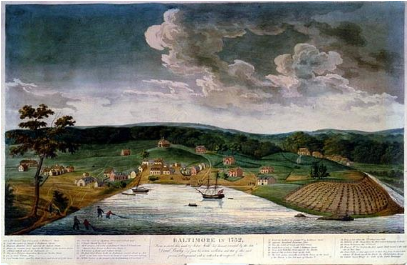
Baltimore Town in 1752. Lithograph. Printed With Buff Tint. Drawn By A. Hoen & Co. Baltimore, 1851.